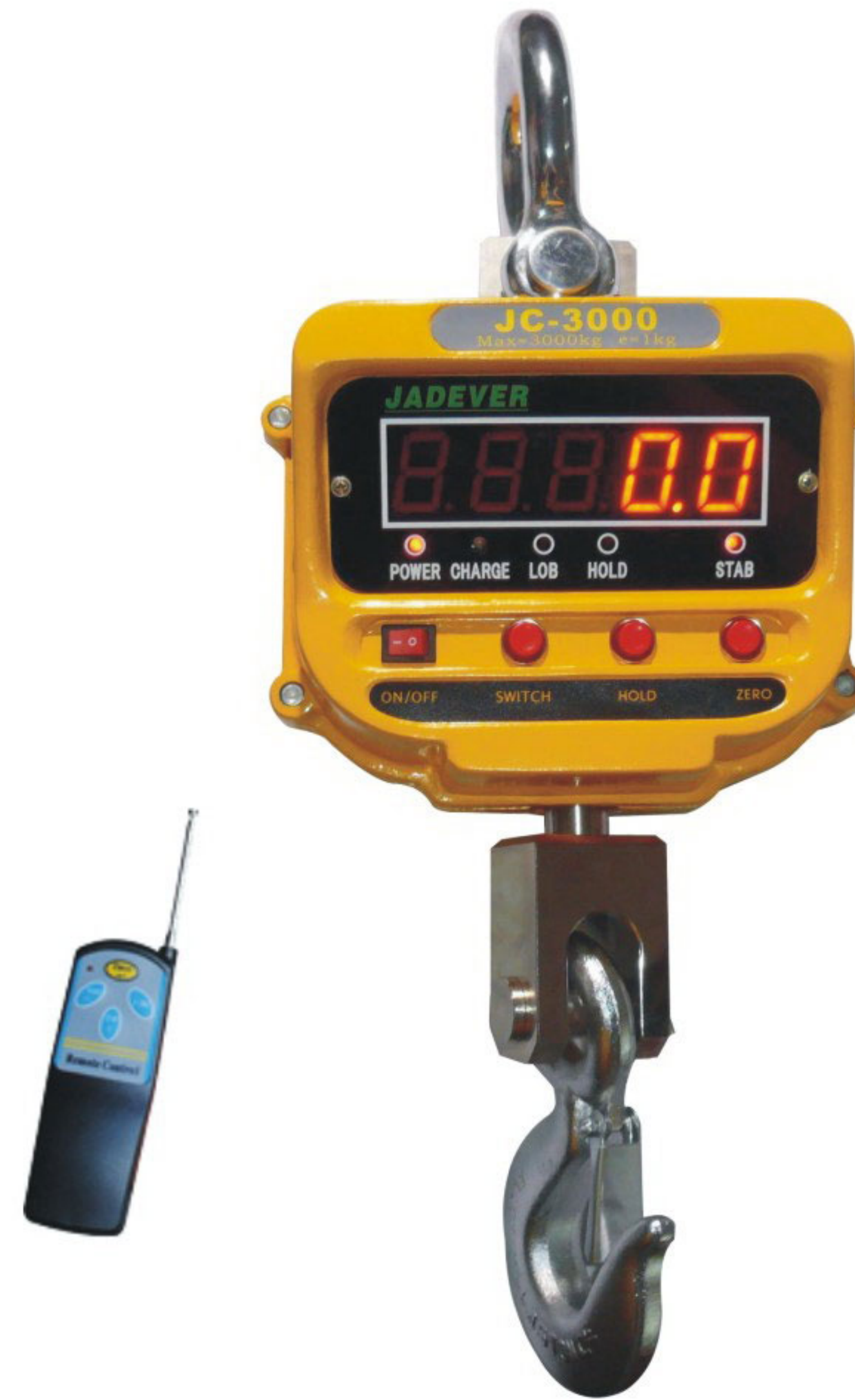
For cap : 600kg-15T