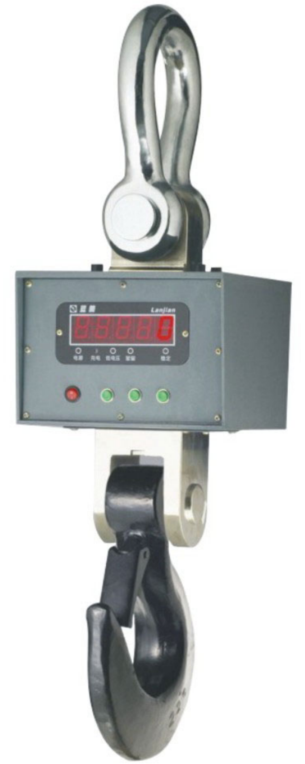
For cap : 20T-30T